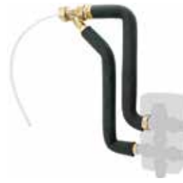
VTR800 Internal thread

ESBE series VTR801 is a pipe in pipe system for use with ESBE circulation sets VTR300 intended for Potable water Hot-Circulation applications with tank without circulation connection.