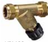
VFA100 Compression fitting

ESBE filling valves for the filling of heating system and other closed fluid systems.