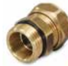
VDA100 External thread

ESBE draining valves for boilers, hot water tanks, pipes etc. Opens automatically when connecting a hose nipple.