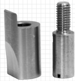
ADAPTER KIT ARA809 PAW